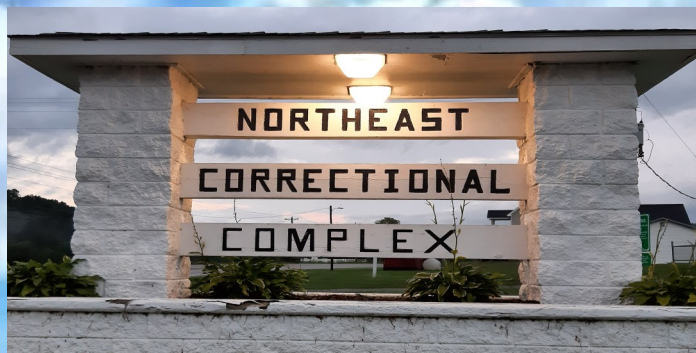
Northeast Correctional Complex (NECX) Mountain City, Tennessee